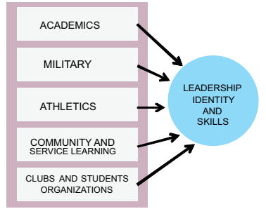
Figure 2. Leadership Development Framework at the U.S. Coast Guard Academy

The USCGA has developed an approach to developing leaders of character that consists of five basic components: academics, military, athletics, service learning, and learning through participation in clubs and student organizations, as presented in Figure 2.As Figure 2 illustrates, credit-bearing academic courses are only one of many methods for accomplishing the learning goals for the USCGA's cadets; this is especially true for goals related to leadership development. Some of the shared educational goals for cadets are achieved primarily through specially coordinated military, residential life, and co-curricular activities. Such learning is not classroom-based and is not fostered by an instructive pedagogy. The extra-curricular learning goals typically focus on self-leadership skills, attitudes, and values; they help students apply knowledge and concepts in practical situations and provide opportunities for the integration and application of knowledge. Cadet learning outside the classroom occurs through contact with other cadets, through their interaction with particular programs, and through various environments in which they live, train, and work. Cadets have various opportunities to select, organize, and reflect upon their leadership learning experiences as part of their leadership development process.